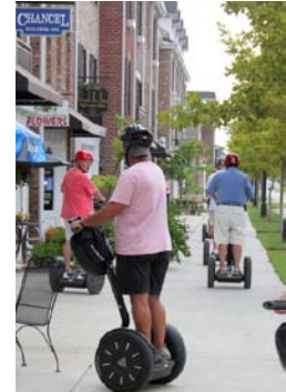
Some Blackmoorians on their Segways...

Watch your calendars for the next fun ride.